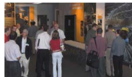
Attendees mingle and talk with speakers and fellow attendees at a break during steel days.